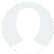
Jason Wood Keller Williams Realty

1 acre lot located in an awesome spot to build in a very nice neighborhood with all the amenities that Lubbock has to offer without city taxes!